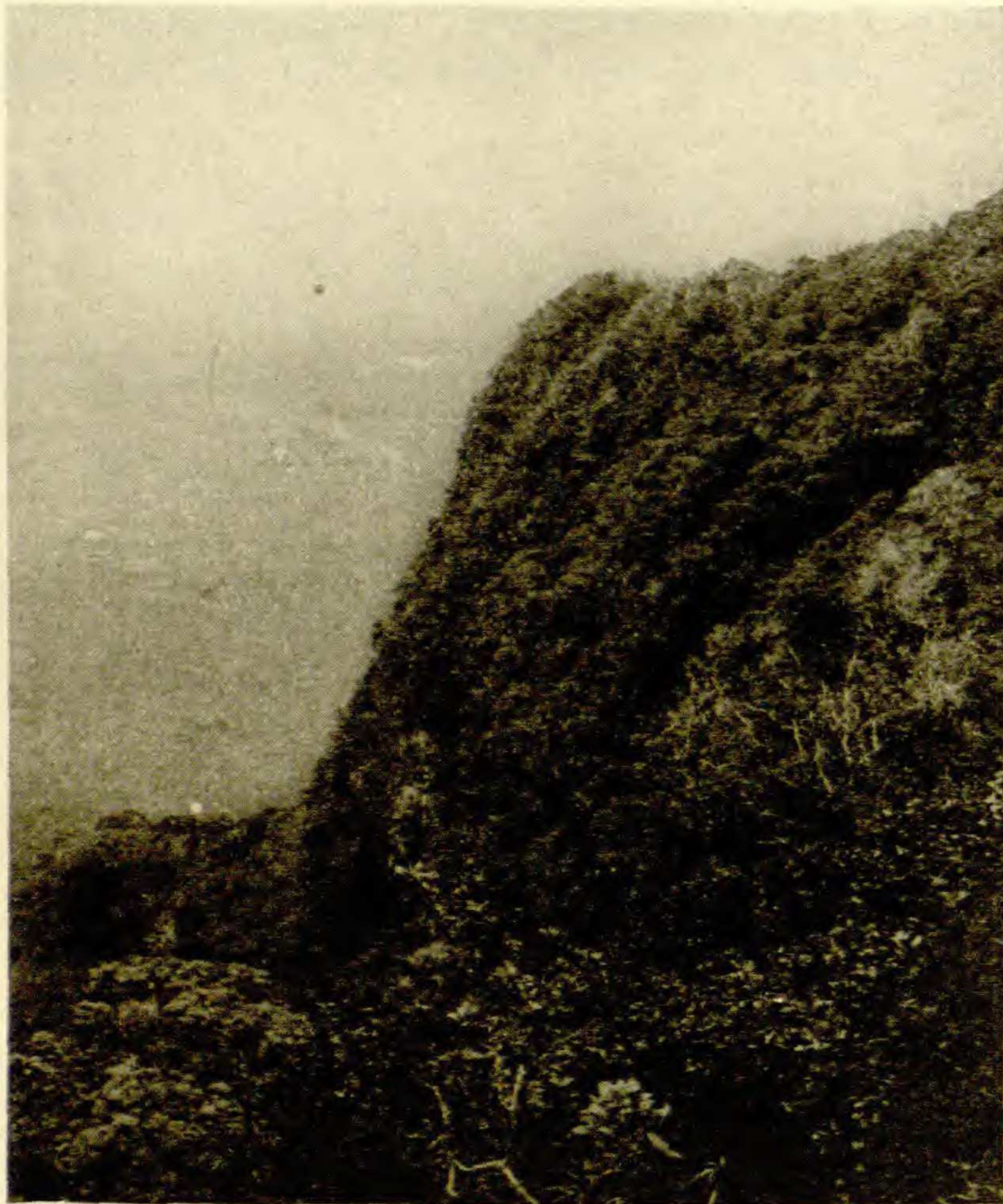
FIG. 3.—Tapestry groves on very steep lateral spurs

The tapestry groves are notably dwarfed, with the aspect of marked and premature senility. The conditions of the substratum